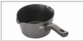
It can be of Aluminium hard anodized.

Good grip knobs bakelite and bakelite with stainless steel cover and base.