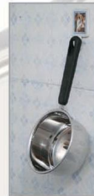
Handles and so designed which create a beauty in the kitchen and ease for use.