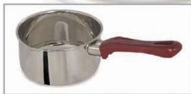
It can be Plain stainless steel.